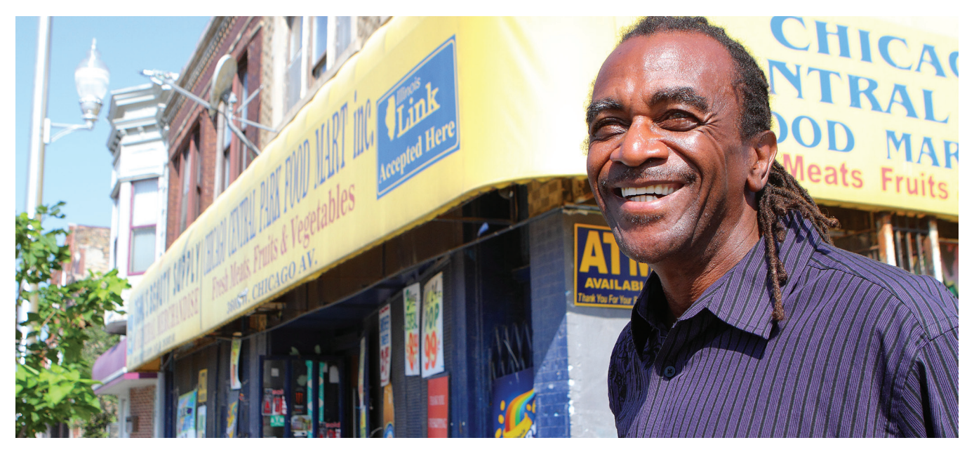
A community networker standing adjacent to a community store that supports obesity prevention efforts in Chicago, IL.