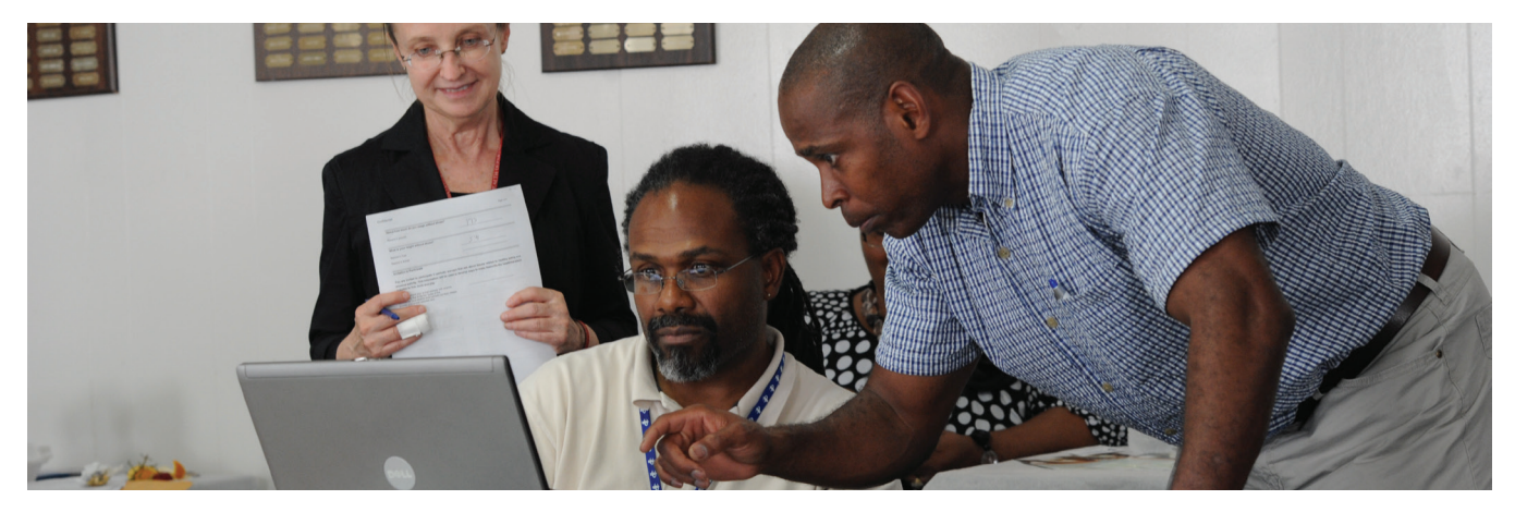
MPHD Staff members participating in a training on community-based focused conversations.