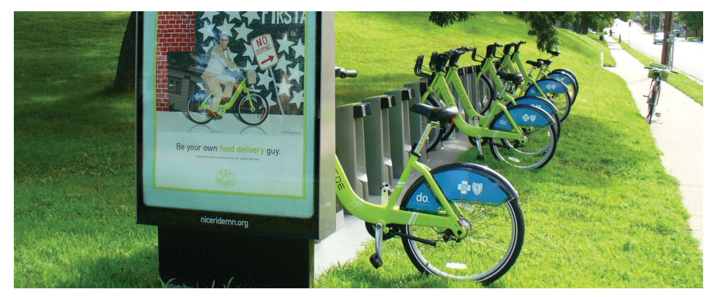
Nice Ride bike kiosk located at Farview Park in north Minneapolis, MN—an area with high rates of obesity and physical inactivity.