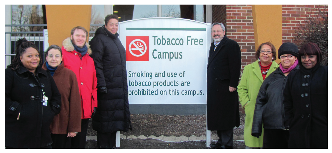
Diverse set of community partners who worked together to increase smoke-free protections for vulnerable populations by implementing a smoke-free campus at Women's Treatment Center in Chicago.